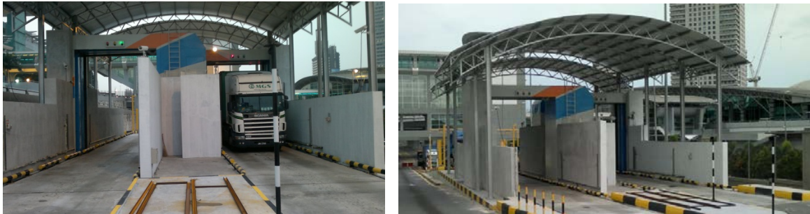
Figure 3. Custom inspection system in Bangunan Sultan Iskandor in BuHit Chaqar, based on two betatrons with energy of 7.5 MeV.

One of the most important advantages of this system is low dose rate on the object of control. It is about 50 microrentgen per one scanning. This parameter is close to normal radiation background. This can be possible because of low dose rate of betatron and high sensitivity of the detector array. Comparison with different customs inspection systems can be seen in Table 2.