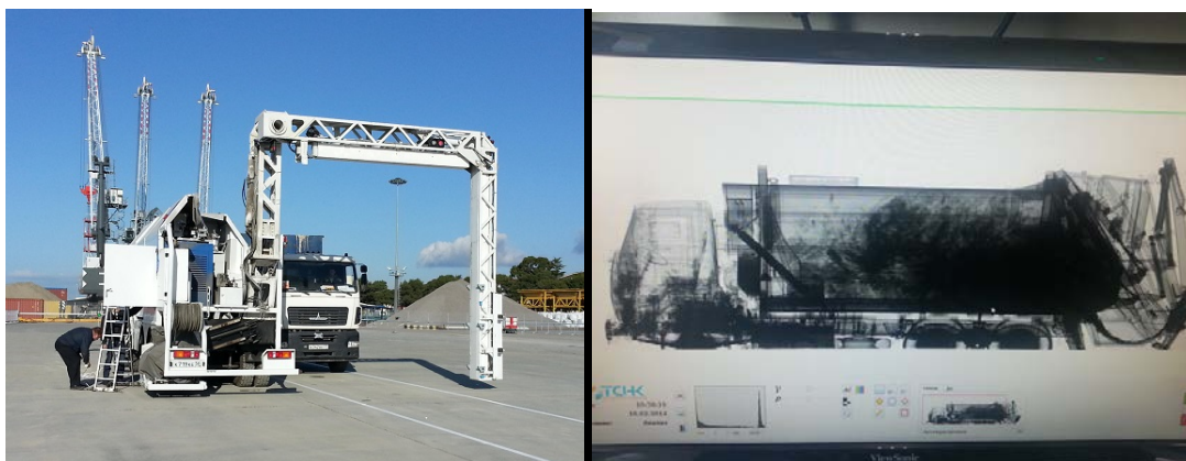
Figure 5. Mobile inspection system in work during Olympic Winter Games 2014 in Sochi, Russia.

Aslo, MIB – 9 betatron was used in mobile inspection system ASD – 65201, which had successfully passed probational tests, working in Adler, Sochi, during Olympic Winter Games 2014.