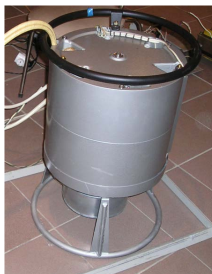
Figure 2. Betatron MIB-9.

Customs inspection system, based on two accelerators with energy of 7.5 MeV, started to work in Bangunan Sultan Iskandar in BuHit Chaqar, November, 2012. This complex is supposed to control 180 trucks per hour or 2000 – per day.