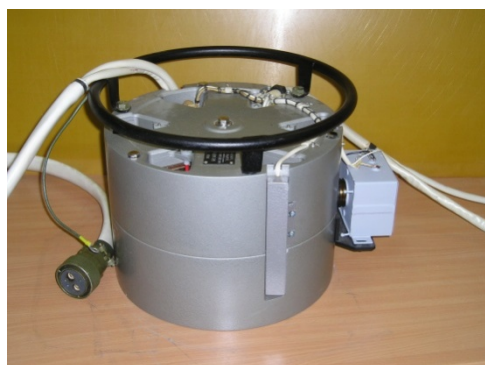
Figure 1. Betatron MIB-5.

All betatrons, designed for inspection systems, have separate radiator with cylindrical – shaped form. This form minimizes radiation protective shielding. External views of radiators are shown on figure 1 and figure 2.