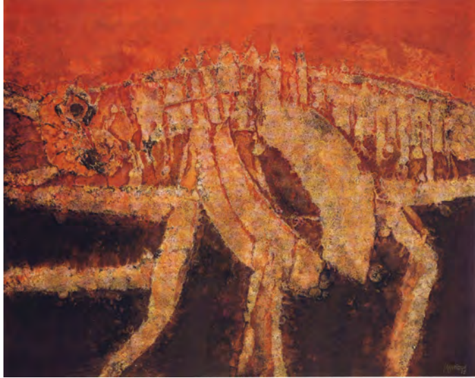
Figure 5: Gabarro (1979, mixed techniques on canvas, 98 × 130 cm, private collection, Las Palmas de Gran Canaria)

evoked by this work is also illustrated Manrique's words: "On my canvases, I am always interested in abstraction as a process of recreation of the soil we tread, its texture, its strength, its somber chromatism. I then lose myself in the revelation of life embedded in the earth, its decomposition, and its death, concluding the earthly cycle". 19