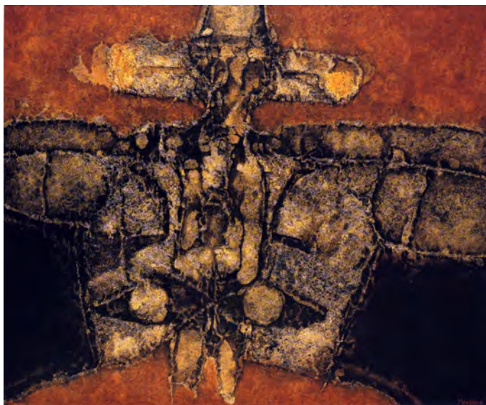
Figure 3: Torso posible (1975, mixed techniques on canvas, 85 × 100 cm, private collection, Gran Canaria)

on the painting is perceptible; its substance completely fills the canvas; yet this does not translate into heaviness of the image itself – Manrique introduces contrasts with white and yellow flashes, “partitions” the image, and uses shades of red, blue and golden brown that are typical of his work. The images are always perfectly balanced compositionally and the weight of the paint is relieved as well by his contoured technique.