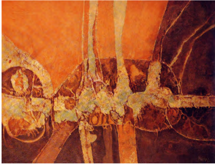
Figure 6: Dumetorum (1980, mixed techniques on canvas, 64 × 80 cm, private collection, Tenerife)

However, maintenance of the same technique gives a similar roughness and texture to the painting's surface. This indicates the unity of matter and the common origin of all elements. The background of the painting – that is, the inanimate world – is determined by the origin of the animal. This is confirmed by the composition of the form of the animal with the colours of the background – metaphorically, taking material from inanimate nature. In other words, evolution produces complex organisms, but it uses the same matter and elements that build the inanimate world “in the background”. This statement is enriched and confirmed by the words of Manrique, who writes: