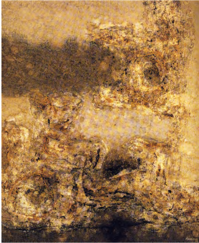
Figure 2: Pintura no 28 (1959, mixed techniques on canvas, 95 × 82 cm, private collection, Madrid)

The general trend in Manrique's oeuvre falls somewhere between optimism stemming from the idea of art and the great objectives defining it, and the consciousness of the finite nature of human life, which brings a note of nostalgia and tragedy to this concept. An example might be the work Torso posible (Fig. 3), in which a figure, splayed as if crucified, is depicted within a horizontal composition. It is transected from above with a bright vertical strip, which merely suggests widely extended male arms. The vertical strip may symbolise the spinal column or part of the cross. In this work, as in many other paintings by Manrique, his method of applying paint merits special attention. The artist repeatedly experimented with this technique (particularly recognisable in his works in cycles, beginning in the fifties); the density of the thickly applied paint actually resembles petrified or still-molten lava, or, at times, the structure of volcanic or fossilised rock. The weight of the paint