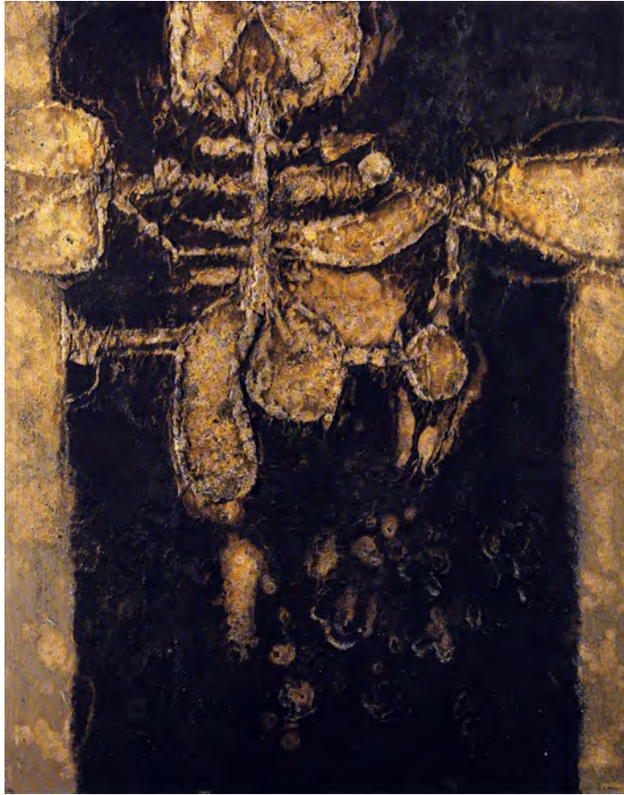
Figure 4: Solo en arena negra (1976, mixed techniques on canvas, 200 × 165 cm, private collection, Huesca)

In Manrique's work, limitations arising from consciousness of the finite nature of life are transformed into strength, since they enable a call for haste. It seems that Manrique reiterates his plea for a conscious, intense and sensual life; he writes in one of his notes "[T]he awareness of the miracle of life and its brevity have made me see clearly that we are impoverished by the tragic sentiment of our existence". 9 Although explicit tragedy can be seen in Manrique's work, it does not assume the character of, for example, typical twentieth-century European existentialism. The extremely powerful fusion with nature that represents and reproduces the very order of things enables him to distance himself from individual experience of the twists and turns