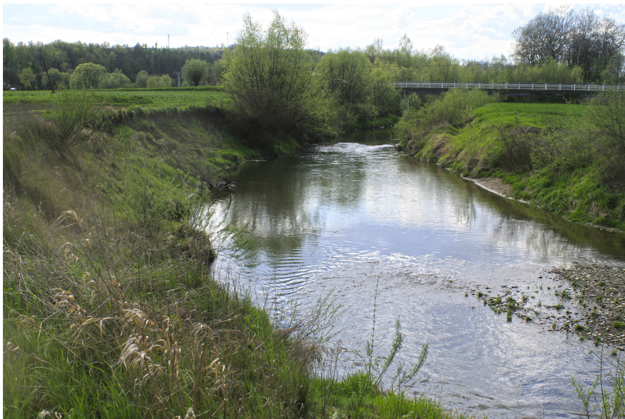
Fig. 3. One of natural microhabitats of the thick-shell river mussel Unio crassus Philipsson, 1788 in the Stradomka river – external side of a meander with clay substratum

Grabie village (208 m a.s.l.); it was not recorded upstream of this site. In the Trzciański stream the highest locality was Trzciana village (238 m a.s.l.). The only site in the Tarnawka river was in the environs of Boczów (234 m a.s.l.) and the only one in the Polanka was near Zalesie (216 m a.s.l.). One-year specimens were found in three sites in the Stradomka river; one well preserved one-year shell was recorded in the Tarnawka river. The number of observed individuals ranged from one to 86. Habitats where U. crassus was found included gravel rapids, mud deposits within large stone artificial embankments and clay sediments (Fig. 3). Potential fish hosts of glochidia in these watercourses were L. cephalus and Phoxinus phoxinus . No other bivalves were found in the Stradomka and tributaries.