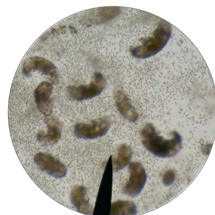
Figure 5: UV tardigrades after 1 hour treatment (Tun). 40x