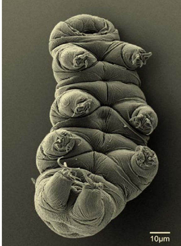
Figure 1: Scanning electron micrograph of tardigrade

Tardigrades, commonly known as “water bears”, are small invertebrate animals. They range in size from 0.1 to 1.5 mm in length. They are bilaterally symmetrical and segmented, having 4 pairs of legs, each with 4 to 8 claws at the ends. Tardigrades reproduce sexually, and asexually in a process known as parthenogenesis. Their diets consist of bacteria and plant and animal cell fluids. Typical environments in which they are found include, terrestrial (on moss and lichen), marine, and freshwater habitats.