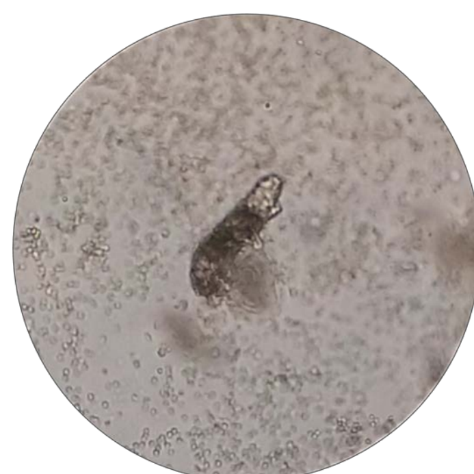
Figure 3: Control tardigrade before treatment (Active). 100x