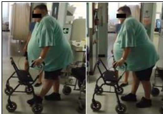
Figure 4. Walking