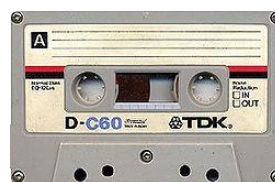
Figure 7. 60 minute Cassette tape.