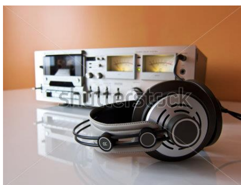
Figure 8. Headphones.