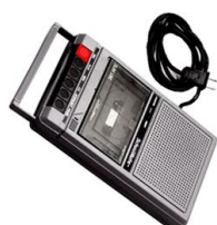
Figure 6. Cassette player.