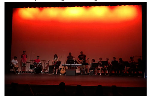
Mako Band in rehearsal for the 2016 Broadway Bash performance