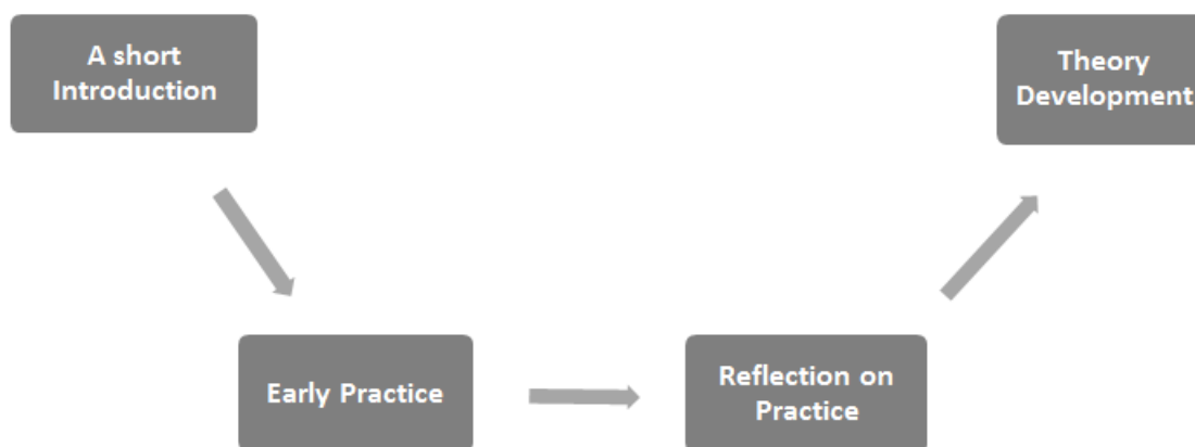
Figure 3. A weekly learning cycle of Early Practice leading to Theory Development.

Authentic activities are activities that “engage students’ lived experience, and students can find meaningful connections with their current views, understandings and experiences” (Stein, Isaacs, & Andrews, 2004, p. 240). In such a case, students develop various theoretical rules of thumb or theoretical generalizations about what to do in different, or unexplored before, contexts (Smith, 2010). The activities in our course design were not experienced as “intimidating homework,” and the effort was to create the ideal “micro-context” for critical reflections (Boud & Walker, 1998). During the Reflection on Practice phase, students discussed and shared their reflections with each other in small-group or plenary sessions. The ultimate aim was to critically understand the different points of view (Livingstone & Lynch, 2000; Paugh & Robinson, 2011), and to synthesize a meta-reflective narrative, as a way of fostering theory development through an interpretive synthesis (Fullana et al., 2014; Suri, 2013). In such a case, the different points of view open up space for a collective zone of proximal development (Brailas, Koskinas, Dafermos, & Alexias, 2015). According to Engeström, “In order to move to a new developmental phase, the team would have needed to take up, discuss, and resolve the issue of the expected and actually achieved outcomes of its work” (Engeström, 2008, p. 47).