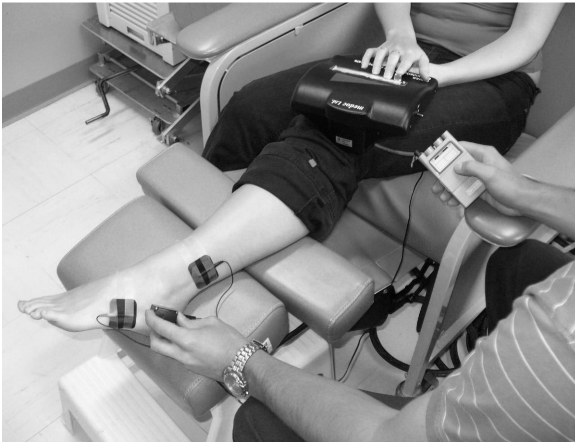
Figure 1. TENS and thermode application