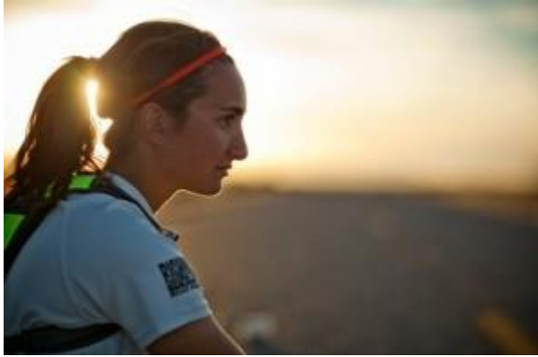
Image taken from Zoe Goes Running .