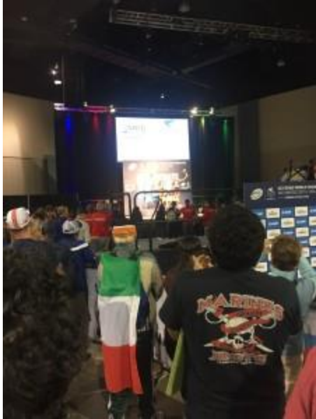
Check out that awesome Italian flag!