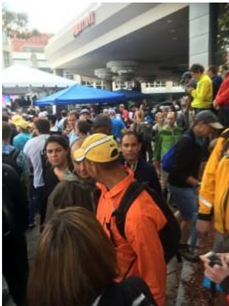
All the colors of the countries being sported in the crowd.