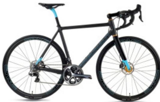
Argonaut Spacebike 2.0 ($13,720)

Still I would like to hope that there will at least be a little more diversity in the crowd of spectators. This is a great opportunity to bring people in from different parts of the US and to show of Richmond, not just to the world, but also to the US population. I hope the crowd will have lots of people from different parts of the country enjoying the race and the festivities that will be going on. I hope that the international crowd will enjoy it too. I think that the plethora of Western Europeans coming will at least be able to appreciate and enjoy the many preserved historical sites in and around Richmond. I genuinely hope the crowd will be more diverse than what I expect, but we'll see once the BIG race starts.