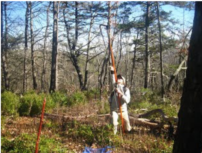
Connie Bolte in the forest doing research on pine trees

Mass transit, bike and pedestrian infrastructure, and mixed land use are ‘important to reducing greenhouse gas emissions.’