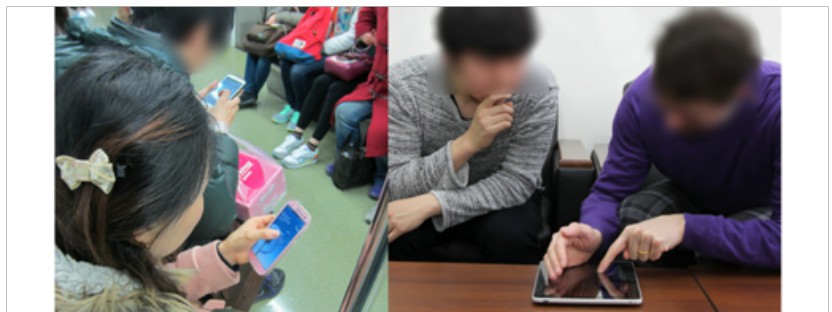
Figure 1 Two casual observation scenarios. On the left, a user authenticates with the Android Pattern Lock on a busy subway. On the right, a user conceals his password entry process from a colleague by cupping his hand over a tablet screen.

This weakness poses particular issues for what we term casual observers - the colleagues and peers who may accidentally learn passwords simply by failing to look away at the critical moment of entry. Given the growing and preferential use of tablets, mobiles and other pervasive devices in entertainment and collaborative work activities and indeed the physical sharing of such devices during these tasks (Rogers, 2009), we argue that is not always possible to maintain the Department of Homeland Security's recommended etiquette. Even without malicious motives, looking away is not as easy as it sounds and not knowing can become a chore. This is problematic as, beyond the fundamental security issues, conspicuously protecting passwords (such as cupping a hand around the input field, as in Figure 1, right) or inadvertently revealing or learning them can result in social discomfort, embarrassment or awkwardness (Sasse, 2011).