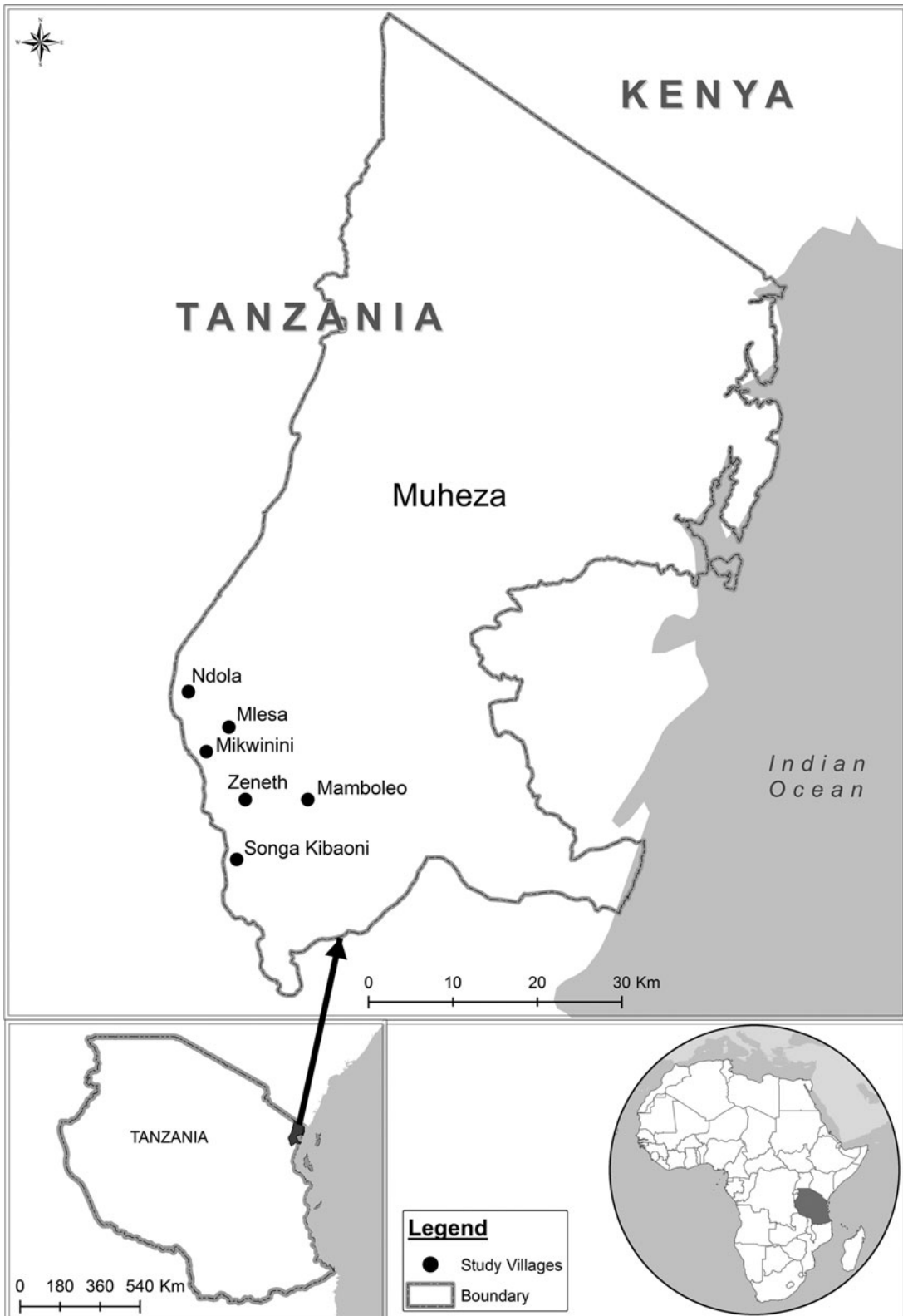
Fig. 1. Map of the area where collections of malaria mosquitoes were performed.