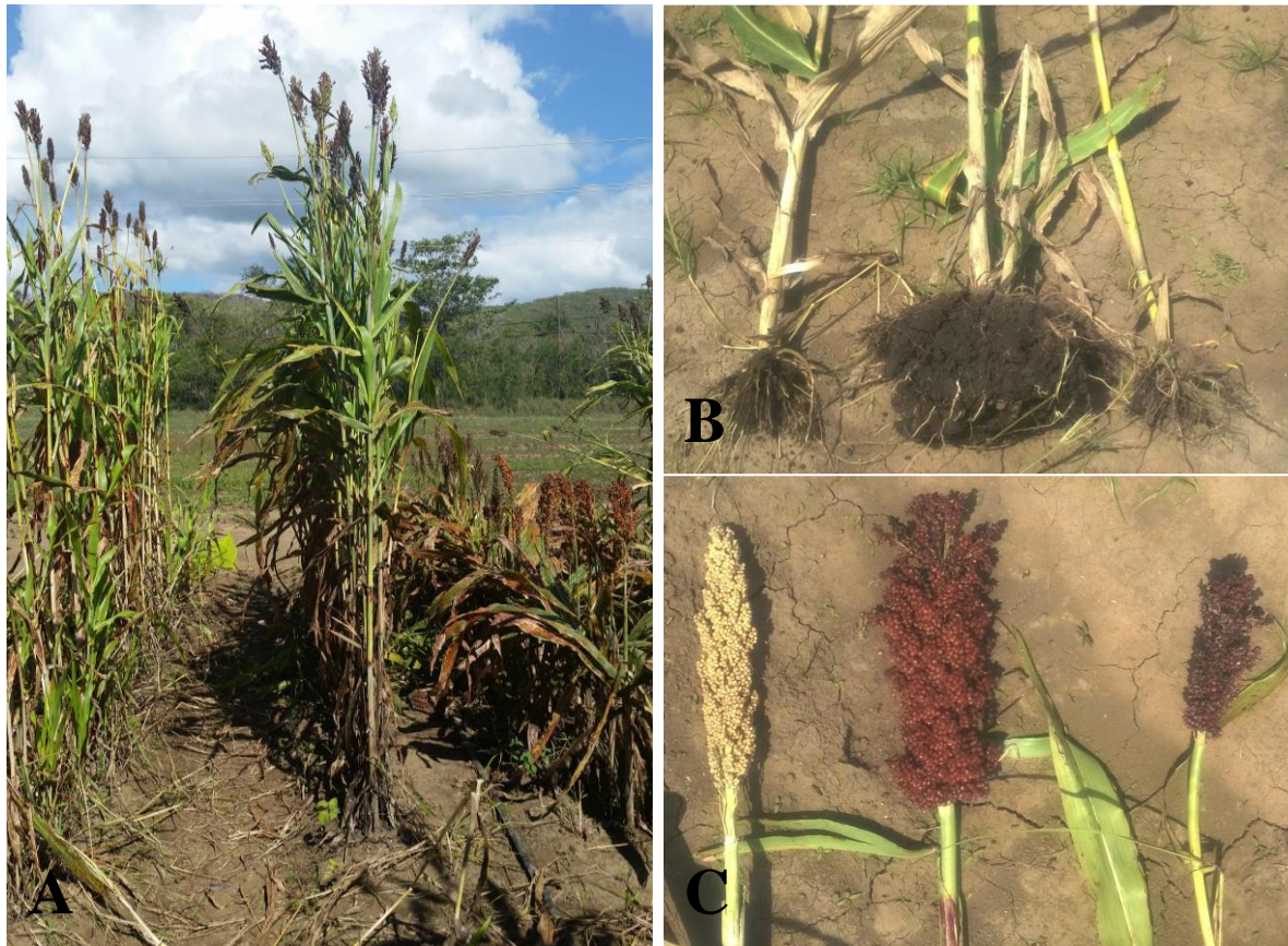
Figure 3: Pictures of heterosis in PI parental lines and PS hybrids. A. Height and yield heterosis for photoperiod sensitive hybrid: ATx645/R11369 (center) compared to female inbred line: ATx645 and male inbred line: R11369 (right). B. Root mass heterosis for photoperiod sensitive hybrid: ATx2928/R09106 (center) compared to female inbred line ATx2928 (left) and male inbred line R09106 (right) and C. Panicle length heterosis for photoperiod sensitive hybrid ATx2928/R09106 (center) compared to female inbred line ATx2928 (left) and male inbred line R09106 (right).

photoperiod sensitive varieties will not flower. This study looks into the feasibility of