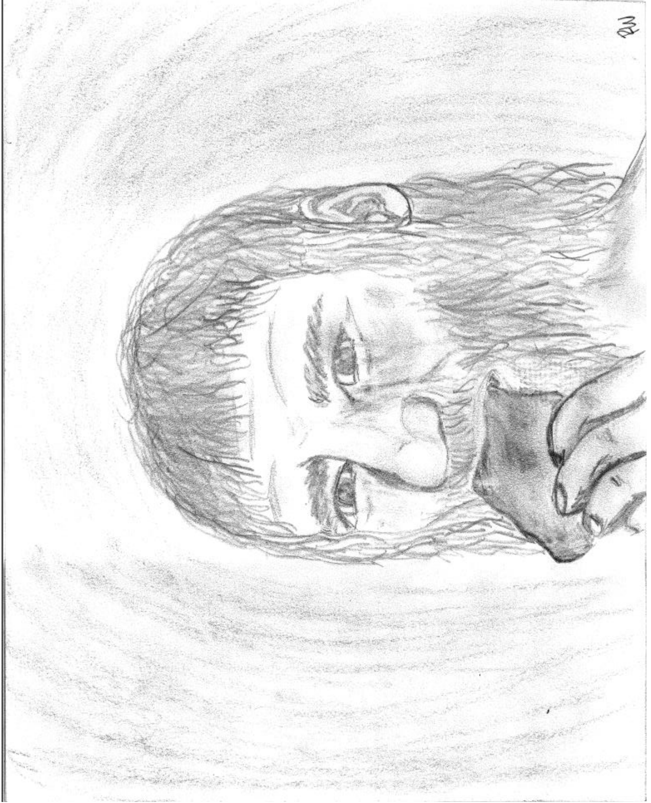
Figure 3. The Eucharist.