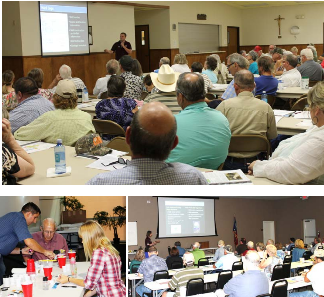
Figure 1. Attendees at the Well Educated program learn how to protect their well water and were able to have their well water analyzed.

The list of watersheds, dates and locations for the completed TWON Well Educated trainings and Well Informed screenings are in Tables 2 and 3. In addition, a map showing attendee volumes at each location is in Figure 2.