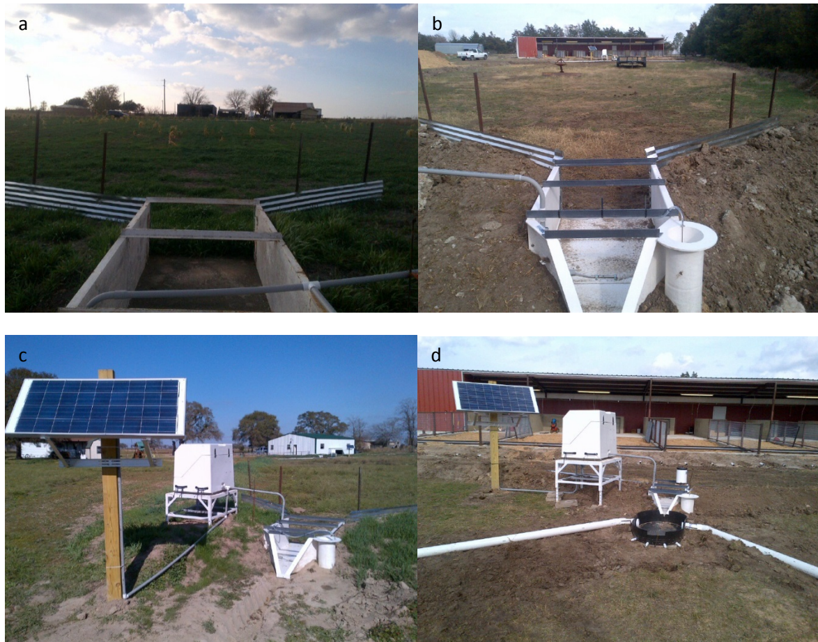
Figure 2. VTA “out” at the Bell County (a), Brazos County (b), and Robertson County (c) sites. Lateral distribution lines were installed below VTA “in” at all of the sites (Brazos County site shown here) (d).