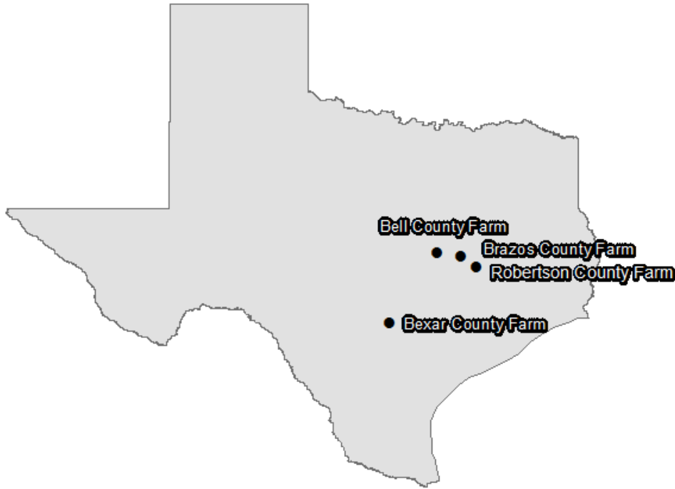
Figure 1. Locations of VTA Sites

A total of 12 water quality monitoring stations were established across the four VTA sites (Table 1; Figure 2). Eight of the water quality monitoring stations use an H-flume, which provide a stage discharge relationship for accurate flow rate measurement. Two of the stations use an area-velocity sensor installed in a culvert or constructed channel to directly measure flow rate. Each of these 10 stations uses a Teledyne ISCO® Avalanche refrigerated sampler to automatically collect water quality samples and to measure and store flow rate. The final two stations are grab sampling stations. A rain gauge was also installed at each facility to measure precipitation.