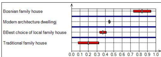
Figure 5. Graphic presentation for the Case 1

Case 1. Economic Indicator (with Energy consumption > efficiency > Investment cost) > CO 2 emission > NOx emission > SO 2 emission) > Social Indicator (with Income per capita > Unemployment > Rent cost).