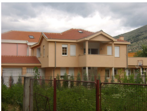
Figure 4. Modern family house

Best choice of local family house. This type of the dwelling is a market available selling house. It is a modern family house designed as the family house reflecting new stile in contemporary architecture. The essential characteristic of this building is modern design and the use of new material.