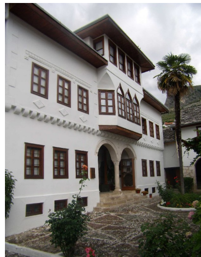
Figure 1. Bosnian family house

Bosnian family house. The essential characteristic of Bosnian house is based on the Turkish architecture from the period of Ottoman Empire. On Fig. 1 is shown the old time dwelling from eighteenth century.