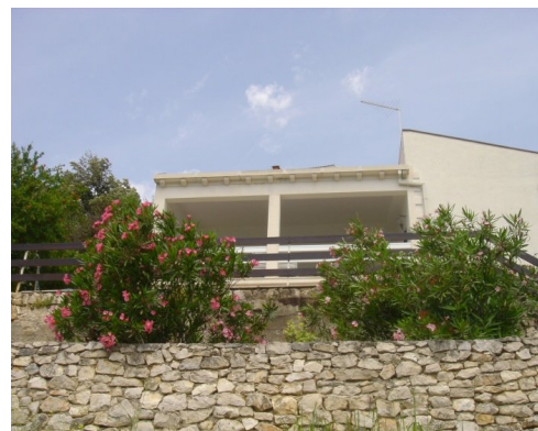
Figure 2. Typical house at the Adriatic Coast

Modern architecture dwelling. The modern architecture building is defined as the high functionality dwelling. It is primary build in the Adriatic region as the summer house. Fig. 2 shows typical summer house at the Adriatic Coast.