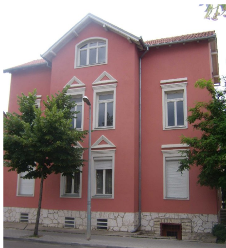
Figure 3. Traditional family house

Traditional family house. In the period after the First World War it was very common to build resident building in private organization. A number of friends with different specialty use to merge in the local community enterprise.