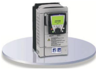
Figure 2. Variable Speed Drive