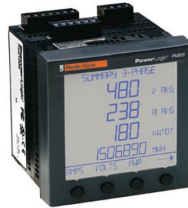
Figure 1. Power Meter

Following these steps ensures that goals are defined, the easiest changes are made first for rapid ROI, and the bigger changes are properly prioritised and measured.