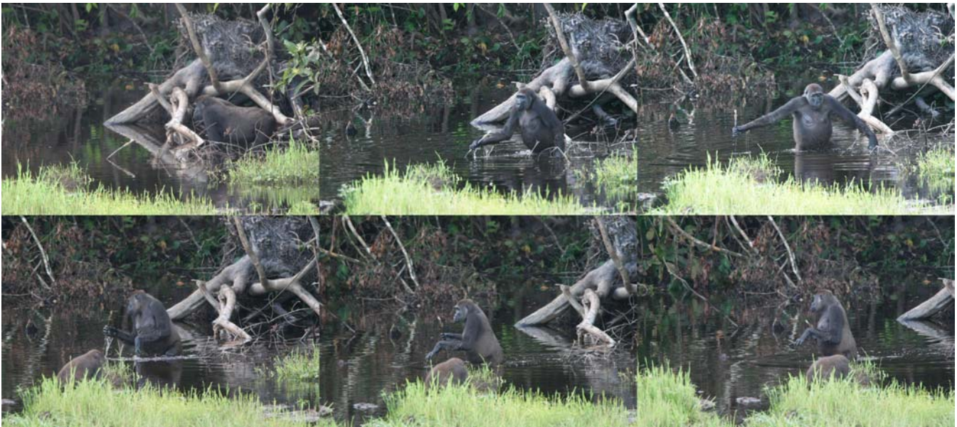
Figure 1. Female Leah Using a Walking Stick while Crossing Bipedally through an Elephant Pool at Mbeli Bai

Female Leah first looked at the new elephant pool and the branch she later used as the walking stick, and entered the water without the tool (not shown). After re-entering the pool and taking the branch with her right hand, she walked bipedally 8–10 m into the water, frequently testing water deepness.