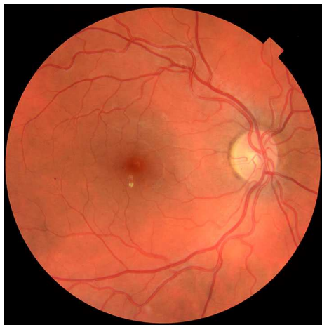
Fig. 2 Exudate within 1 disc diameter (DD) of the centre of the fovea