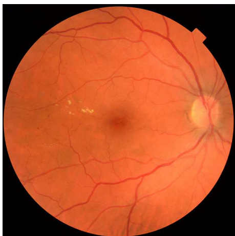
Fig. 3 Circinate or group of exudates within the macula

Programme is undertaken every 3 years. EQA visits are an integral part of Diabetic Eye Screening Quality Assurance. Formal EQA visits to a screening programme provide the forum for a review of the whole multidisciplinary screening pathway and an assessment of the effectiveness of team working within the screening centre and associated referral sites.