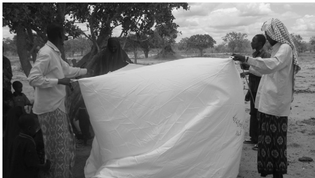
FIGURE 1. A Dumuria net being displayed in the field.

standard LLINs (these results have not been published in peer-reviewed journals) (P. Guillet, unpublished data).