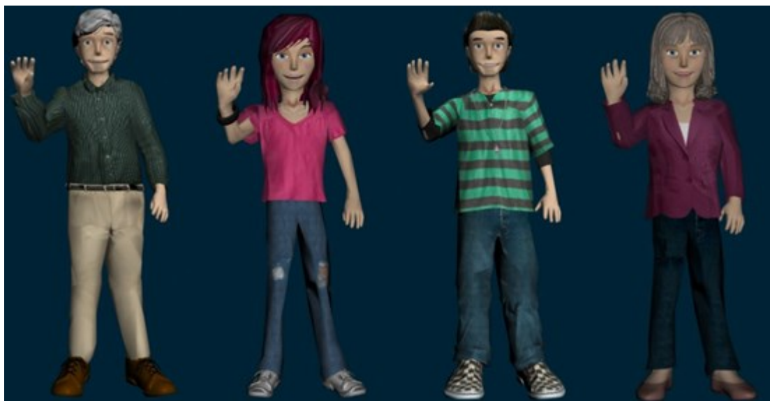
Figure 1. Agents. Left to right – Old male, Young female, Young male, Old Female