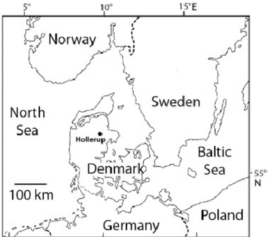
Figure 1. Location of Hollerup, Guden Valley, northern Denmark.