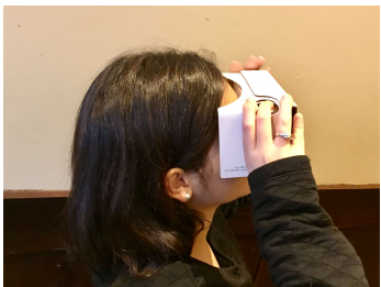
Figure 2: Head-mounted display using mobile phone. The viewer moves head and/or body to navigate.