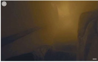
Figure 5: In this scene, the video switches to a first person POV of a gloved hand reaching through the smoke. The viewer can navigate as "their" hand attempts to remove debris and reaches to the staircase banister. (CC-BY BBC)