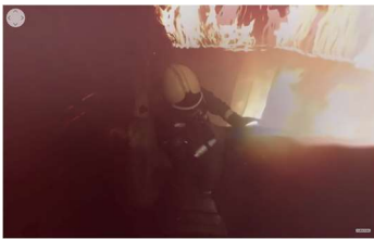
Figure 6: In this scene, the POV switches to another firefighter, Anthony, getting stuck at the debris at the staircase. The viewer can navigate to see Anthony struggling while the flames envelope the area.

highest immersion score, followed by GC without headphones, MW with headphones, and then MW without headphones. We predicted that GC would be more immersive than MW because it takes up the users' field of vision, allowing the person to concentrate more on the story and not to be distracted by their environment. Similarly, headphones (+) would be better than no headphones (-) because headphones block out distracting sounds from the environment.