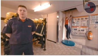
Figure 8: Some participants did not notice the other firefighters sliding down the pole. A hotspot (top right of figure) could help to direct the viewer's attention so that they turn to the right in time to see it.