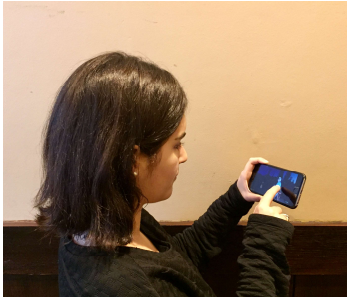
Figure 1: Magic window on mobile phone. The viewer moves smartphone or taps with finger to navigate.