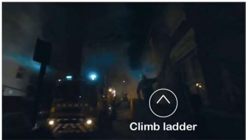
Figure 9: In this overlay the user can click when they are ready to climb the ladder to enter the bedroom, moving them to the next scene. This allows them to explore and then move on at their own pace, rather than trying to keep on top of a narrative that is continuously moving.

said "I totally forgot I was wearing a physical headset", and P12 said "headphones made it more immersive, because the sound is more scary and stressful on headphones". But why isn't this also the case for MW? Some participants said that they were used to viewing videos on their smartphone without headphones, so the experience of wearing headphones was unusual to them. Another possible explanation is that if a person is able to see things in their peripheral vision, but unable to hear the sound, that this is more distracting than if they heard that sound and chose to block it out to focus on the video. These possibilities will need to be explored more in future research.