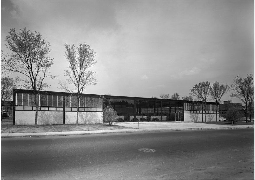
Figure 1. Exterior view of the Commons Building at IIT (photographer: Hedrich-Blessing), courtesy Chicago History Museum #HB-17346-J.

photographic representation – both on its own terms and through the prism of the Rem Koolhaas-designed McCormick Tribune Student Center, which adds to and incorporates the Commons Building.