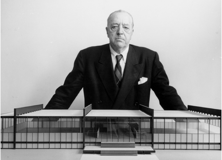
Figure 4. Mies van der Rohe with a model of Crown Hall (photographer: Arthur Siegel), courtesy Chicago History Museum #ICHi-15955.

confront a host of inconvenient questions: who else is in the room? What other models were set aside in order to highlight this one?