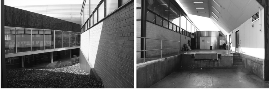
Figure 2. The MTCC as a “frame” for the Commons Building. At left, the interior courtyard of the MTCC with the south wall of the Commons Building visible at right; at right, the MTCC loading dock with its roof extending over the west wall of the Commons Building, visible at left. Photographs by Author, 2011.

and over time it was visited and photographed by casual and amateur photographers. Following the competition results, photographs of the Commons Building were strategically deployed by both proponents and critics of Koolhaas’s design. Contemporary photographs of the building appear in architectural and campus guidebooks and on websites such as Flickr.com. Examining the ways in which photographs of the Commons Building appear in these various contexts allows discussion of the critical dimensions identified above and permits us to trace the evolution of the mutually reinforcing relationship between architecture and photography.