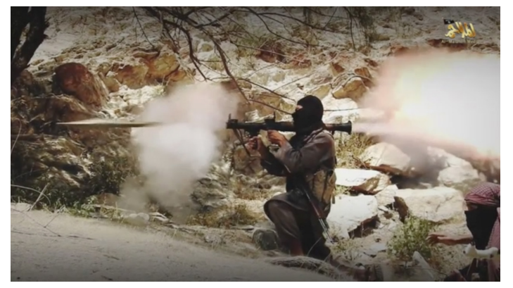
Screen capture from a November 2016 AQAP video

interpretation of Islamic law in al-Mukalla.<sup>h</sup> In al-Mukalla, AQAP managed to build a measure of goodwill due to this relative restraint and its provision of limited public works.<sup>26</sup>