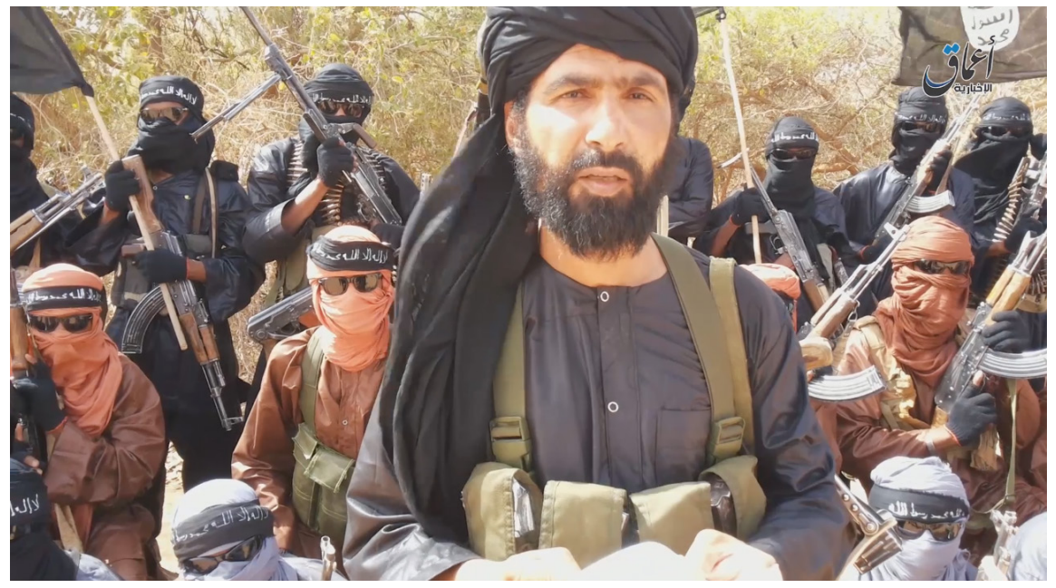
Screen capture from October 2016 video of Murabitoun's bay`a to the Islamic State

attacks<sup>d</sup> near the borders of Burkina Faso, Niger, and Mali. The first attack occurred on the nights of September 1-2, 2016, when ISGS targeted a gendarmerie in Burkina Faso near the Nigerien border and killed two guards. The second occurred about a month later on October 12. The group attacked a police outpost in Intoum, Burkina Faso, just kilometers from the Mali border, which killed three police. The third, and certainly most sophisticated, was ISGS' orchestration of an attempted jailbreak of the high-security Koutoukale Prison in Niamey, Niger, on October 17, 2016. Though guards ultimately fully repelled the attack—killing one assailant wearing a suicide vest—the attempted prison break was important in that the prison held suspected Boko Haram affiliates and other suspected Islamist militants from the Sahara and Sahel. Apart from these larger-scale attacks, ISGS has undertaken other criminal activities.<sup>e</sup>