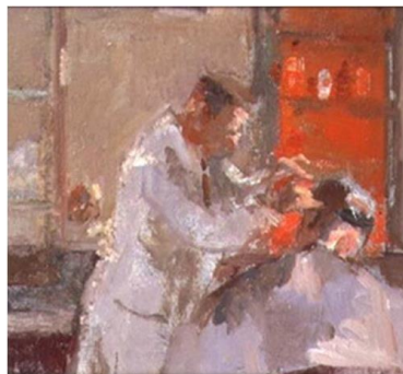
At the Barber's by Ruskin Spear, 1947. Oil on canvas