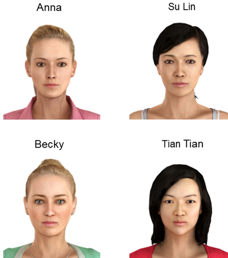
Figure 2. Avatar appearances. This image was created using Vizard virtual reality software (WorldViz Inc, Version 5.4, http://www.worldviz.com/virtual-reality-software-downloads/ ).

Debriefing. The participant provided written and verbal answers to a series of questions to determine whether they had noticed the mimicry manipulation or guessed the purpose of the experiment.