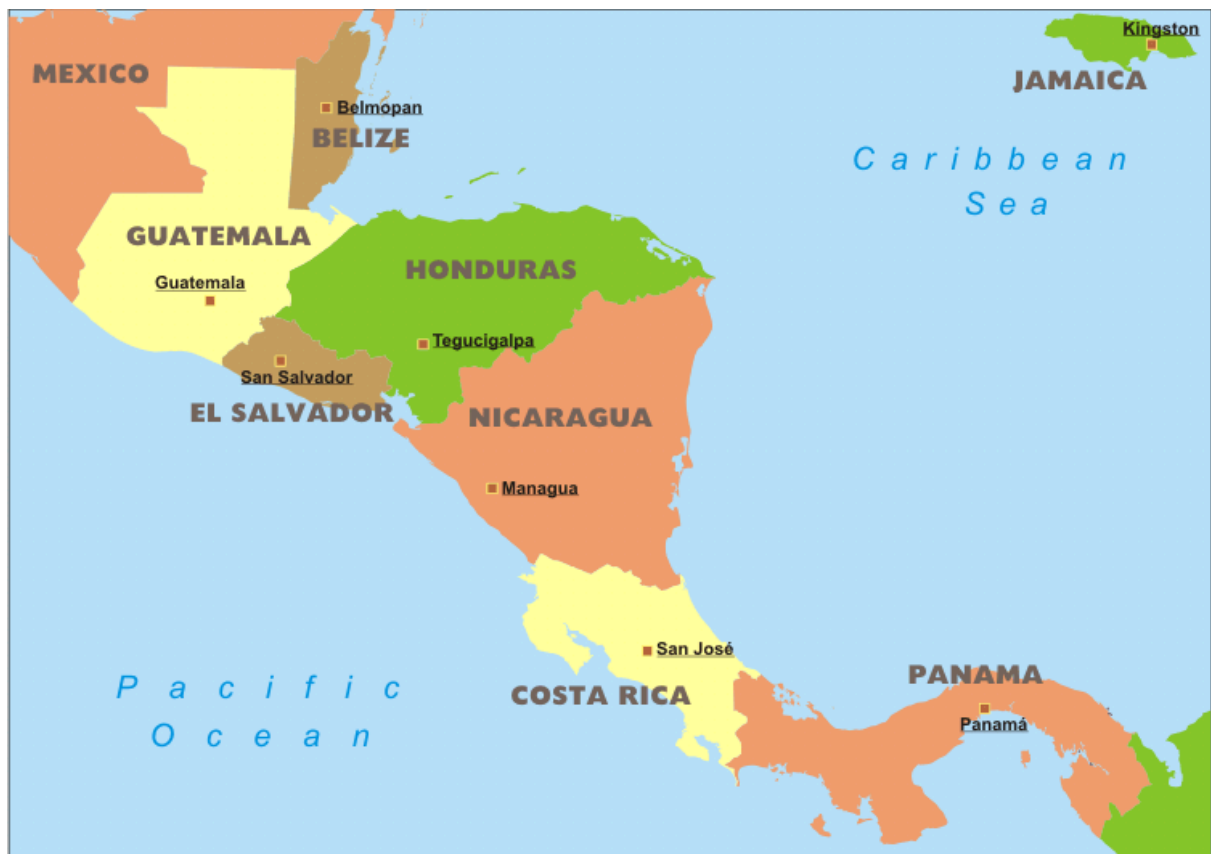
Figure 1. Map of Central America

Located on a narrow strip of land between North and South America, Central America (Figure 1) is a relatively small region with a total land area of 49 million hectares. The six states 1 have many commonalities, sharing a language, cultures and histories. The region is also characterised by inequality and poverty. Even in Costa Rica, which has the region's highest GDP per capita, around 20% of the population live below the poverty line (CEPAL 2011).