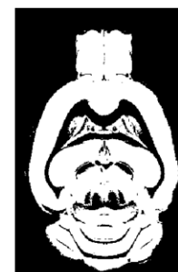
Figure 2. Grey matter mask