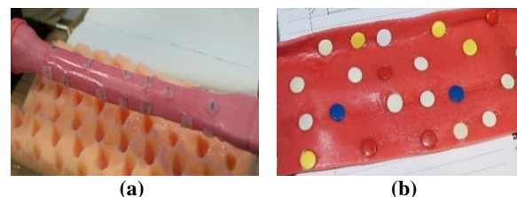
Figure 2. a) External view of the colon phantom; b) View of the opened phantom with the circular pins attached.

Figure. 2 a) shows the deformable and impermeable colon phantom used in this study (Lifelike Biotissue Inc, Ontario, CAN). During tests small coloured pins were inserted along the phantom track to emulate polyps, as shown in Figure. 2 b).