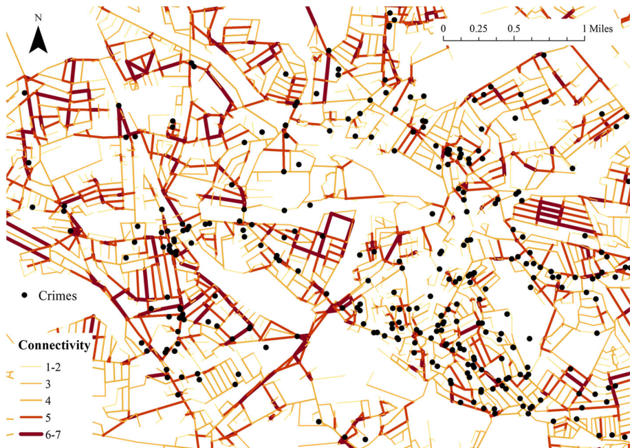
Fig. 3 Section of research area displaying the connectivity values of the street segments against the spatial distribution of crimes

space–time-specific crime opportunities, which result from the routine activities of individuals (Cohen and Felson 1979). Previous research has shown ambient population levels to vary over time, with pedestrian flows peaking at around 1 pm and dipping at 4 am, and with weekdays tending to be busier than weekends (Aultman-Hall et al. 2009). For this reason, it is possible that the relationships observed between the configuration of the street network and crime occurrence may vary in strength (and significance) at different times of the day (see also Johnson and Bowers 2013). In the same way, movement flows driven by commercial land uses may also be time-dependent, as different businesses will be open at different times of the day. The land use data examined here was not sufficiently detailed to allow us to disaggregate on this basis, but future researchers with access to better land use data and crime data from higher-crime areas may be able to conduct such analyses.