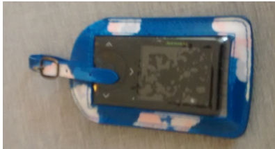
Figure 1: Luggage tag used to carry a CGM