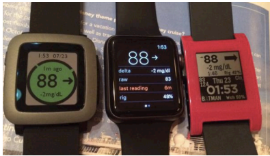
Figure 2: Three different smartwatches running Nightscout [14]