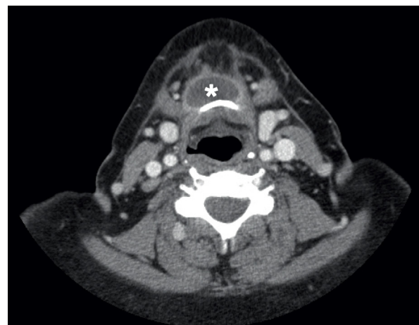
Fig. 3. CT scan of the neck on postoperative day 21. An axial, post-contrast CT scan of the neck at the level of C3. The asterisk denotes the position of a 2.7 cm simple cyst with a thin enhancing wall consistent with an infected thyroglossal cyst. Chrysostomos Tornari and Bhik T Kotecha

A CT scan of the neck demonstrated an infected thyroglossal cyst without any tongue base or deep neck collections (Fig. 3) and a subsequent ultrasound-guided needle aspiration reduced the size