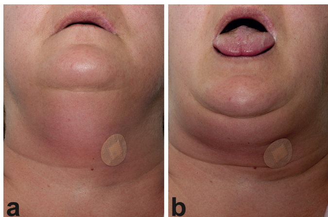
Fig. 1. Clinical photographs of the infected thyroglossal cyst on postoperative day 22. Anterior views are shown with neutral tongue position (a) and tongue protrusion (b). The dressing indicates the location of ultrasound-guided needle aspiration.

menced. Six applications of six watts were delivered to the tongue base at the typical location during the first treatment [1]. The patient subsequently reported an approximately 25% improvement in her symptoms.