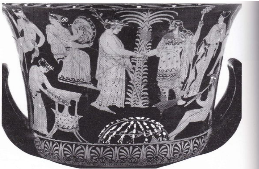
Figure 2 (Baringer 2008, 154)