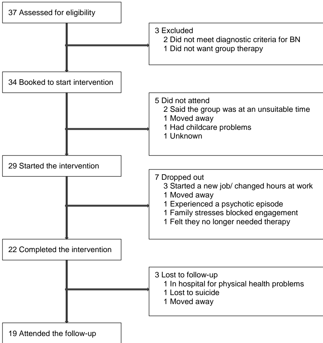
Figure 1: Flow chart depicting participant flow through the study