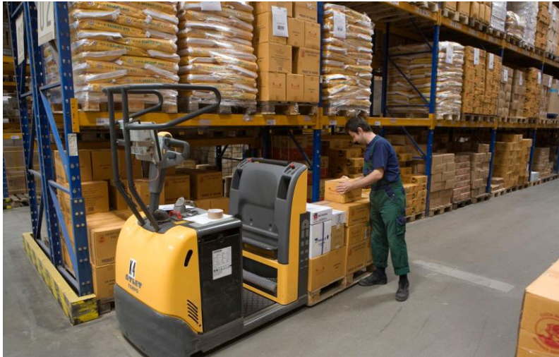
Figure 2 – Storage and order-picking system with selective pallet racks

dominant component of total operation time). Most models in literature optimize the layout minimizing the expected travel distance to store/retrieve an item. The theoretical background to warehouse layout can be found in [6] with derived expressions for optimal warehouse designs represented as continuous storage areas both for non-rectangular and rectangular designs. A simple model for optimal storage layout that minimizes the expected travel in the rectangular storage area with parallel aisles assuming random storage and single location of pickup and delivery point (P/D), which might be located in any place along the front aisle or in the corner, was presented in [7]. That model is used as a part of our proposed integrated model in Section 3. Similar idea for optimal storage layout, although in case of dual commands, was used in [8].