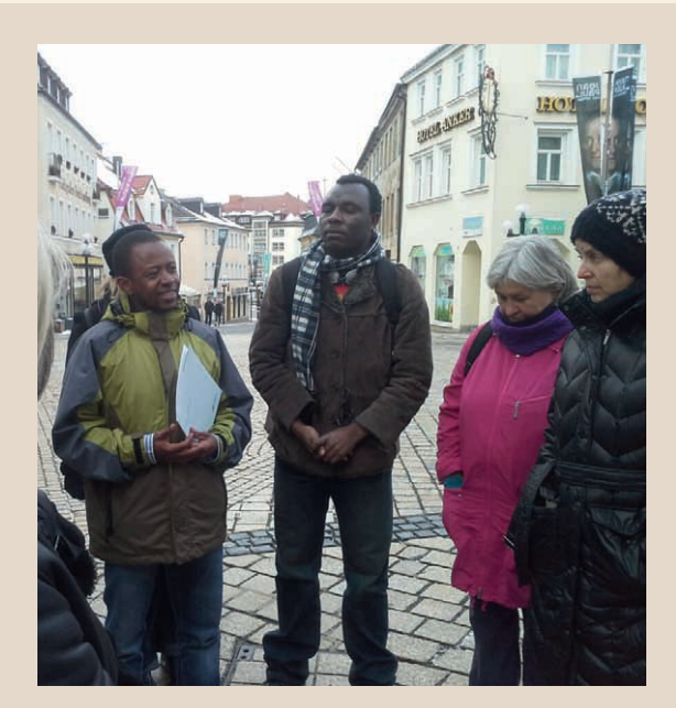
Exploration of the city from another perspective

with the spirit of this tour: a reawakening of one's heritage and identity through personal experience of the city space.