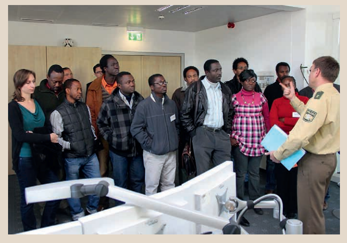
A police officer explains his work

To round up this exciting day, the police gave us yet a last pleasant insight. At the ultra-modern control room of the Upper Franconian Police, we listened