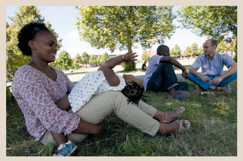
BIGSAS Junior Fellows sharing experiences on parenting

which supported mainly women and parents who could not pursue their studies effectively due to the need to divide time between their studies and their children. However, with time we realised that acknowledging women or parents only would not meet the needs of the wider BIGSAS community where a lot of aspects (culture, religion, sexuality, gender, ability, class etc.) of diversity exist. The Gender Programme was consequently developed into the Diversity Programme.