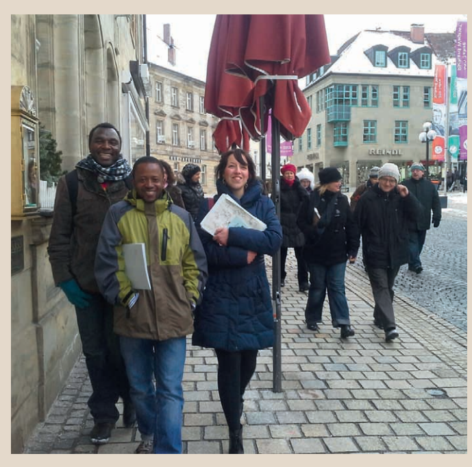
The guides are proud of their work