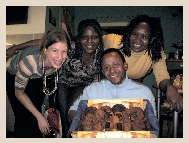
Thank you - Sweet thank you!