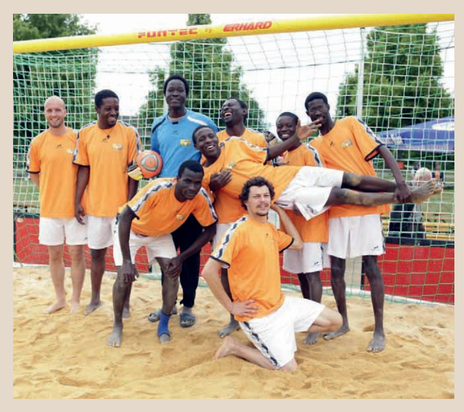
BIGSAS FC celebrating their victory

Besides research, BIGSAS JFs and SFs take time off to exercise, not only in gyms, but also out in the open playing football! BIGSAS FC, the men's football team, was officially created in 2011. It comprises over 20 JFs and SFs as well as friends of BIGSAS. The ladies of BIGSAS are not left behind; their football team is a usual attraction in the Hof garten every week where they train. Though we label the teams as men's and women's, they are indeed mixed – a solid take-off point of BIGSAS Diversity Programme (see pp. 34 ff.).