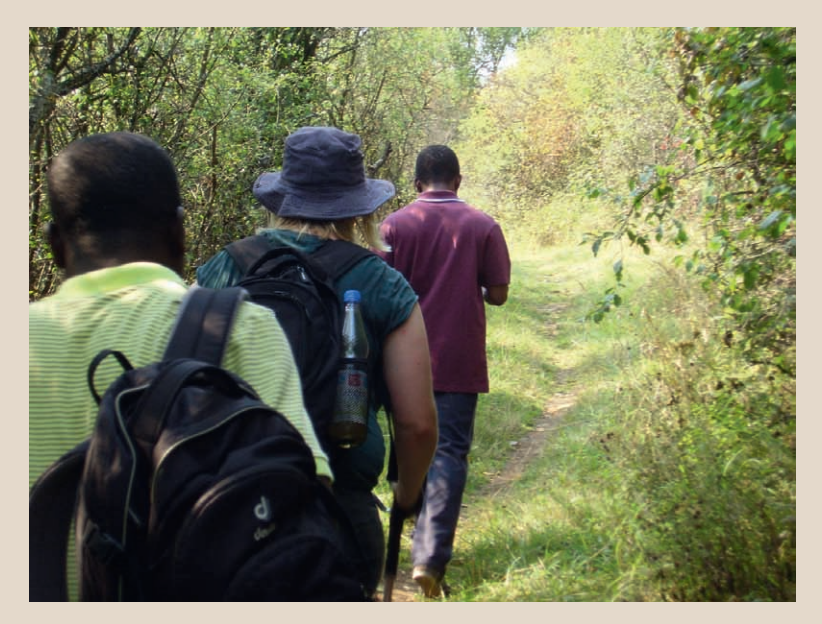
The hiking crew walk up the hill in the Fränkische Schweiz