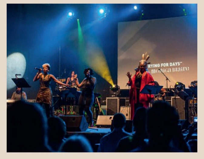
Open Air Concert 2013: The Black Rock Coalition Orchestra gave a stunning performance by intertextually saluting their musical heroines

Then came 2013. As yet another successful event, BIGSAS convened its third and so far largest Festival of African and African-Diasporic Literatures, under the title "Intertextuality: Dialogues in Motion", from 20 to 22 June 2013. This year's festival was supported with funding from the prestigious German Federal Cultural Foundation, Kulturstif tung des Bundes . The 3-day festival investigated