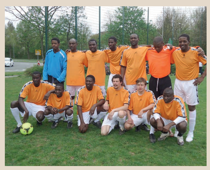
The BIGSAS Mannschaft

Every summer, BIGSAS FC takes part in the Wilde Liga football league organised by the City of Bayreuth. In 2012, we played in the first division of the league against nine other teams and finished sixth