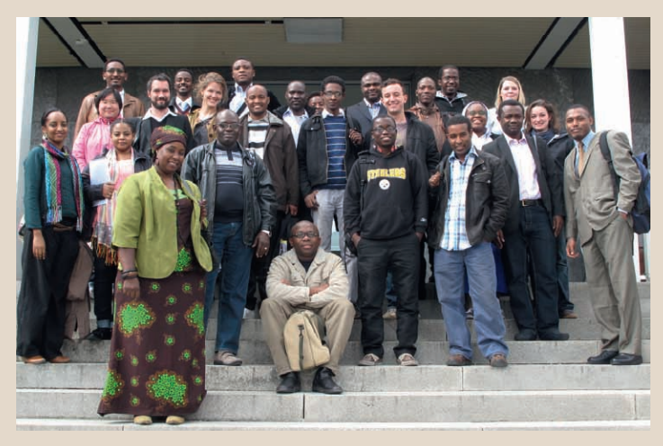
The BIGSAS community welcomed the international newcomers at the Welcome Day in April 2012

The BIGSAS Welcome day is a regular event at the beginning of every semester to officially welcome new Junior Fellows to BIGSAS.