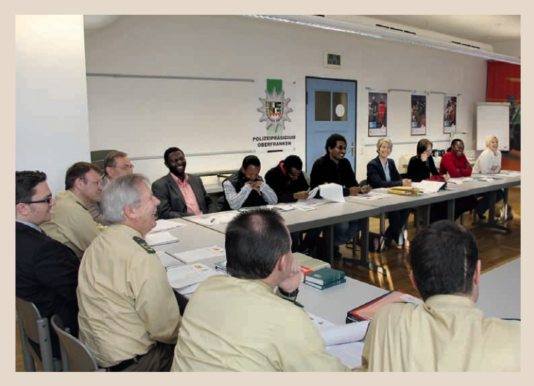
A meeting of new insights: BIGSAS and the police during their discussion

The rare opportunity of getting an inside story of the functioning of the Oberfranken Police in Bayreuth was not only an avenue for institutional interaction, but intimately relates with my PhD research on "Militarization in Post-1986 Uganda: Politics, Military and Society Interpenetration". Specifically, I was interested in the patterns of relation that exist between the police and the military in Ger-