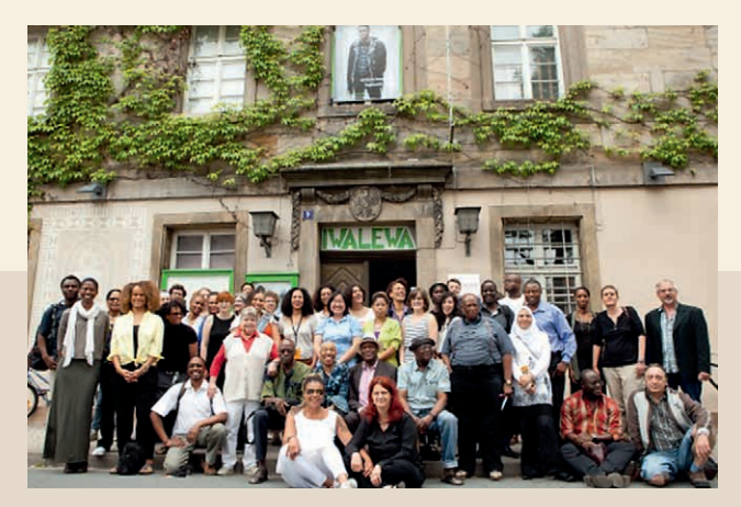
Guests and team members of the 2013 BIGSAS Festival of African and African-Diasporic Literatures

Hop Formation) all framed the festival's literary and academic core programme with their respective contributions to the act of "Remembering Flash Forward".