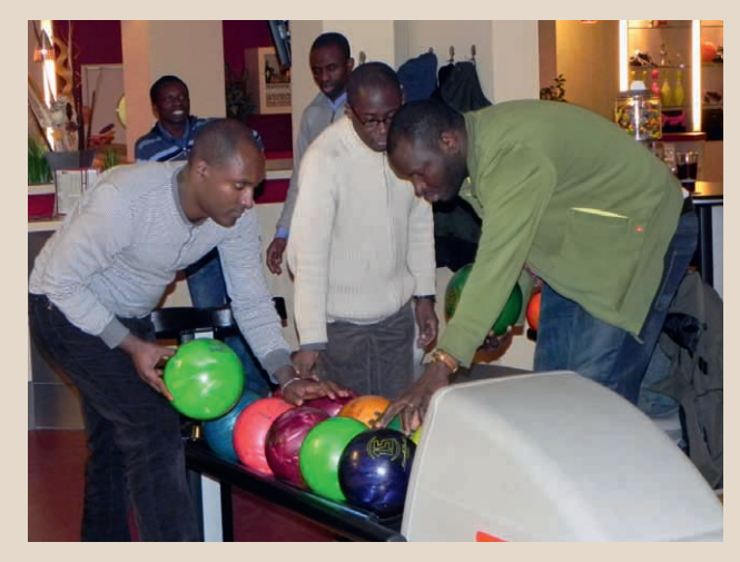
Choosing the right size of the ball