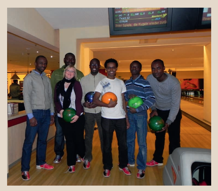
The bowling team