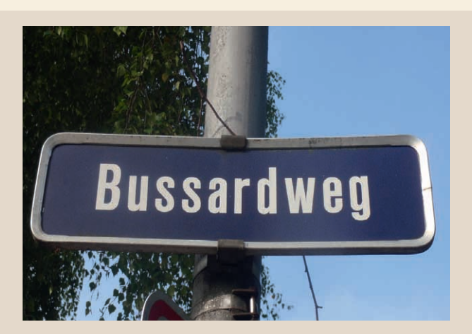
"Weg" means "road"

As you enter the compound through the main entrance, the doorpost reads "Rheinstraße", but sooner or later, you discover that this name is only as important as the bus that takes you to the town or university campus. While the "Rhein" street is written clearly at the entrance, one has to enter the space through the backdoor to unearth the somewhat obscure signpost that indicates the entrance to "Bussardweg". It took us some weeks of Deutsch classes to know that "Weg", means "road" and I still do not know the specific meaning of "Bussard". However, after a few months as tenant, your memories of "that place" become conditioned by the alliances, good neighbourliness, friendships and unions that it enables you to build. It is a window into an interracial space, literarily and figuratively.