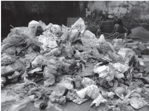
Plastic collected from stake nets

Global Programme of Action for the Protection of the Marine Environment from Land-Based Activities (GPA) of UNEP was established in 1995 and is the only inter-governmental mechanism which addresses the impacts of land-based sources and activities on coastal and marine environments and human well-being. Its goal is to prevent, reduce, control or eliminate and/or recover from the impacts of the degradation of the marine environment from land-based activities by facilitating the duty of States to preserve and protect the marine environment. The 'Global Partnership on Marine Litter' (GPML) was launched in June 2012 at Rio + 20 in Brazil. It seeks to protect human health and the global environment by the reduction and management of marine litter as its main goal, through several specific objectives. 'The Future We Want' an outcome document of Rio+20 (2012) supports the sustainable management of wastes through waste minimisation activities by the 3 R's (Reduce, Reuse and Recycle) and also through energy recovery. It also calls for the development and enforcement of comprehensive national waste management policies, strategies, laws and regulations. The 'London Convention on the Prevention of Marine Pollution by Dumping of Wastes and Other Matter' an international treaty limits the