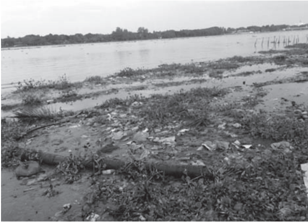
Solid wastes dumped in the Cochin Backwater