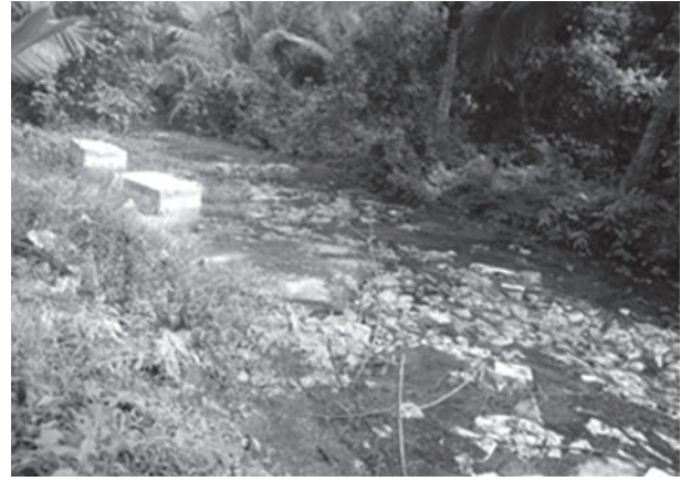
Clogged canals impacting local biodiversity

textile. Of these, plastics consisted of 32% followed by textile (28.7%) glass (17.2%), metal (15.6%) and leather (6.6%). The dominance of semi-degradable material which can be recycled clearly indicates the potential we have to move towards a zero-waste situation with proper waste management. Also, in the marine and coastal areas there are large biomass of floating weeds and sea grasses which are degradable and can be readily composted, but very little effort is currently made to effectively manage these.