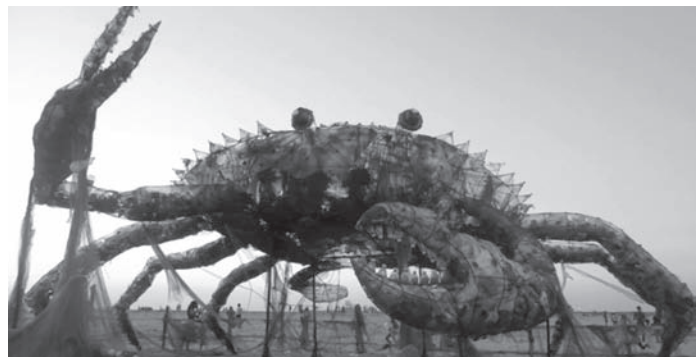
Mad crab installation Art using discarded plastic bottles