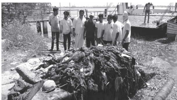
Wastes collected during cleaning of Cochin Backwaters

Fishermen are directly impacted by the increase in litter in the coastal areas and attempts have been made by fishermen themselves to remove litter in the past. In 2012, members of 12 Kayal Samraksha Samithy with technical support from Asoka Trust for Research in Ecology and Environment (ATREE) and Vembanad Nature Club collected about 40 bags of plastics and used this for levelling about 150 m of the Muhamma -Kalyanasseri Road in association with the local Panchayat (New Indian Express, May 16, 2012). Recently another local attempt to remove the solid waste accumulated in Cochin backwaters was initiated by the youth belonging to Dheevara Sabha. The litter accumulated in the shore line area is in layers and intermingled with silt, making it heavy and difficult to remove. Using a hired canoe they are using pumps to splash water over the substrate during low tide to loosen the settled litter,