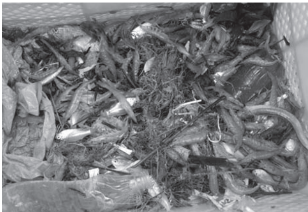
Plastic waste collected during experimental trawl fishing operations