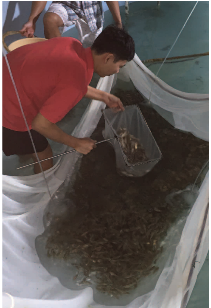
FIGURE 3. Harvesting orange-spotted grouper fingerlings.