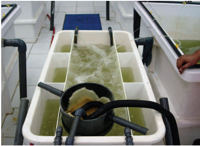
FIGURE 1. Tank for harvesting rotifers ( Brachionus rotundiformis ).