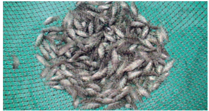
FIGURE 5. Orange-spotted grouper fingerlings at 95 dph.

mg/L, ammonia concentration 0.18 \pm 0.05 mg/L, nitrite concentration 0.021 \pm 0.003 mg/L and pH 7.8 \pm 0.4 . All LRTs were harvested on day 40 by reducing water level in the tanks and scooping out post-larvae with hand nets (Fig. 3). The number of 40-d old post-larvae collected was 200,463 averaging 21.1 \pm 4.3 mm total body length and 199 \pm 92 mg body weight. The average survival rate of larvae was 9.3 \pm 4.9 percent.