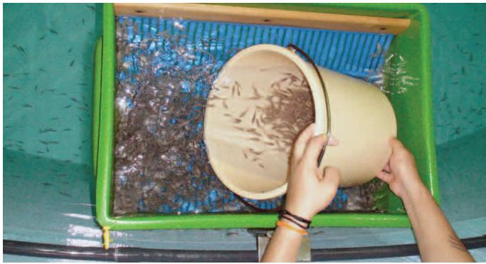
FIGURE 4. Size grading orange-spotted grouper fingerlings.