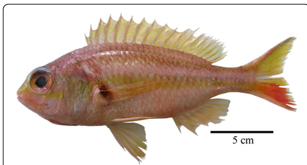
Fig. 1 Parasclopsis capitinis Russell 1996 of 226 mm total length collected from Cochin Fisheries Harbour, Kerala, India

deposited at the National Marine Biodiversity Referral Museum at the Central Marine Fisheries Research Institute, Kochi (GB.31.9.82.4). The fishes were caught by gill netters operating off Cochin at depth range between 50–80 m. Morphometric measurements,