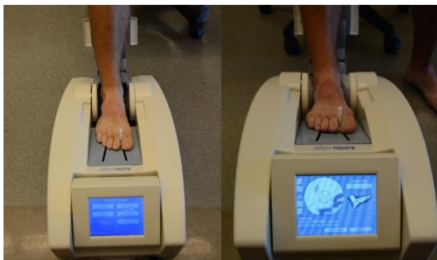
Figure 1. Achilles InSight QUS Device with foot placement before and during measurement.

on the OCSI measurement. The level for rejecting the null hypothesis was set at p < 0.05 . Effect size is reported using partial eta squared ( \eta_p^2 ). Measurement consistency was determined via pre- to post-testing by intraclass correlation coefficient (ICC \alpha ), typical error, and coefficient of variation (9). To evaluate the variability of the device relative to the magnitude of the measurement, a Bland-Altman plot (2) was created. The summary statistics are reported using M \pm SD .