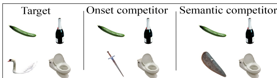
Figure 1: Display configurations for the target word zwaan , swan, featuring a target-present display, an onset competitor display ( zwaard , sword) and a semantic competitor display ( schild , shield), each along with three unrelated distractors.

All words in the experimental and filler sets were picturable. Photographs were selected from existing databases [16,17] or searched on the internet and edited to fit the resolution and size of the other pictures.