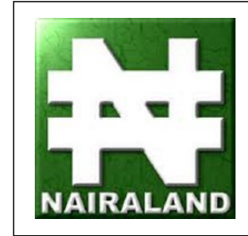
Figure 1. The Nairaland logo.

The activities of Nigerian participants in the Diaspora are significant because of their acknowledged contributions to both Nigeria's political and economic developments. They not only contribute to discussions and debates in online forums but also contribute to organising and mobilising offline protests (see Chiluwa, 2015). They have also utilised the forum to educate young Nigerians on their civic responsibilities and mobilising their family members to participate in the electoral process, especially by voting (see African Sun Times , 23 March 2015: http://africansuntimes.com/2015/03/nigerians-overwhelmingly-praise-diaspora-nigerians-for-urging-nigerians-to-call-nigeria-to-get-their-family-members-to-vote/ ). The Diaspora Nigerians have called on the Nigeria government to provide them the means of exercising their voting rights while abroad. The new Nigerian President has, however, explained the reasons why this may not be feasible at present such as legislation, logistics, financing and confidence in the electoral process ( Vanguard , 26 August 2015: http://www.vanguardngr.com/2015/08/buhari-why-nigerians-in-diaspora-cant-vote-now/ ).