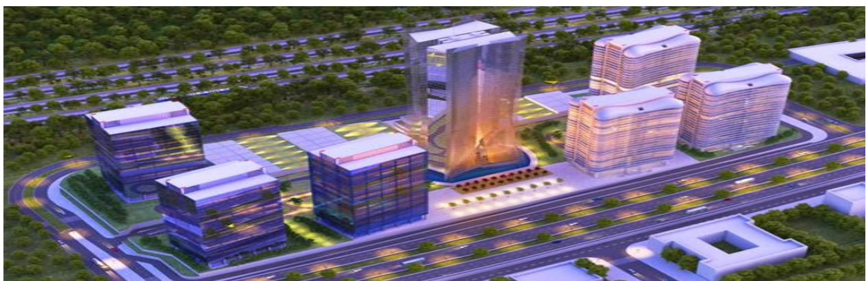
Figure 2: The proposed World Trade Centre in Abuja; Source: www.churchgate.com (2013).