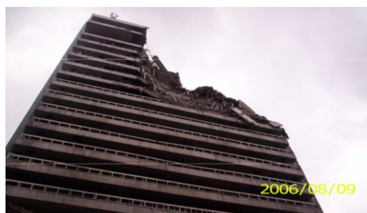
Figure 3: The Nigerian Industrial Development Bank (NIDB) building upon collapse.

The abrupt, shocking collapse of tall buildings has produced countless tragedies throughout history, emphasizing the need for sound, safe and ethical engineering design. Structures that were outwardly rock-solid all over the world have cracked, split, and disintegrated underneath people’s feet. In some instances, the collapse of towering edifices took less than ten seconds; bringing them down to the barest, turning them into debris and thereby burying people. Despite the fact that many structures are aesthetically pleasing; a lack of attention to proper safety standards, human error, and unenforced building codes potentially lead to truly terrifying catastrophes. Many tall buildings have collapsed over the years. Some of the most devastating collapses include the twin towers of New York, USA that went down as a result of the terrorist attack of September 11, 2001 killing close to 3000 persons, Sampoong Departmental Store, South Korea that crumbled under 20seconds in 1995 killing about 500 people, the Lotus Riverside Building in China that toppled over, completely intact without crumbling in 2009 and the New World Hotel, Singapore which in 1986 collapsed in less than 60 seconds, killing about 50 people. The causes of collapse of the last 3 cases of tall building collapse can be traced to poor engineering judgments and incompetence of the workers involved in the construction process.