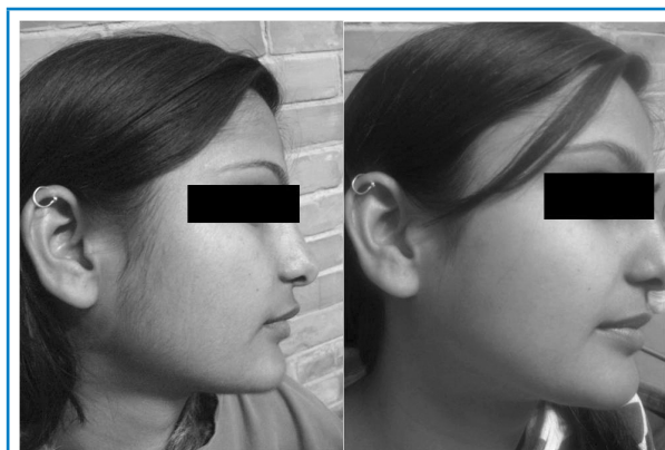
Figure 2. Hirsutism of a PCOS patient before and after long pulse Nd: YAG laser.