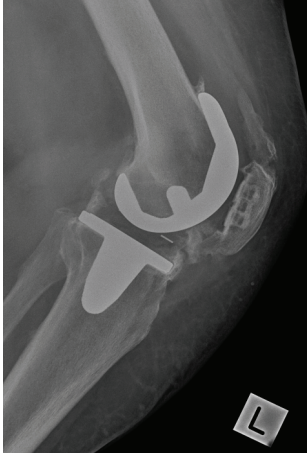
FIGURE 1: Postoperative radiographs of the total knee replacement at 8 months showing the severe heterotopic ossification.